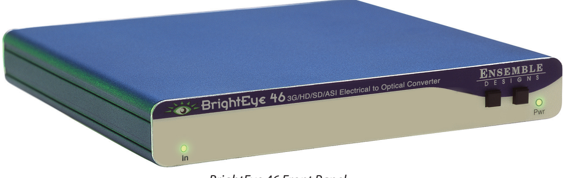
BrightEye 46 Front Panel

Monitoring of the BrightEye 46 converter is performed from the front panel as illustrated in the figure below. This is a simple device with no interface to the BrightEye Control application. There are no adjustments required for this unit.